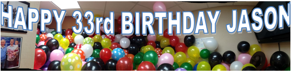
Fairfield Inn Brunswick celebrated GM Jason Greene's 33 rd birthday by filling his office with 892 balloons, filled over 3 days with the help from multiple staff members, an air mattress pump, some lung power, and a lot of sore fingers from tying so many balloons!