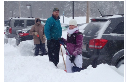
Fairfield Inn and Suites- Exeter

Refusing to be slowed down by all the snow