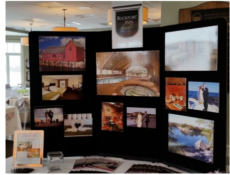
Matt and Missy Anzivino representing Rockport Inn & Suites at a wedding trade show