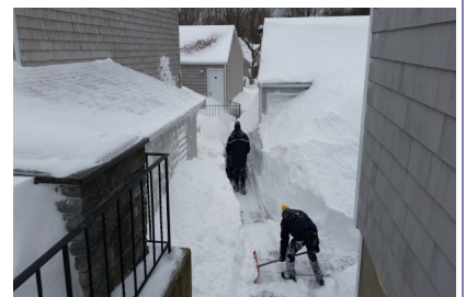
Rockport Inn and Suites

Refusing to be slowed down by all the snow