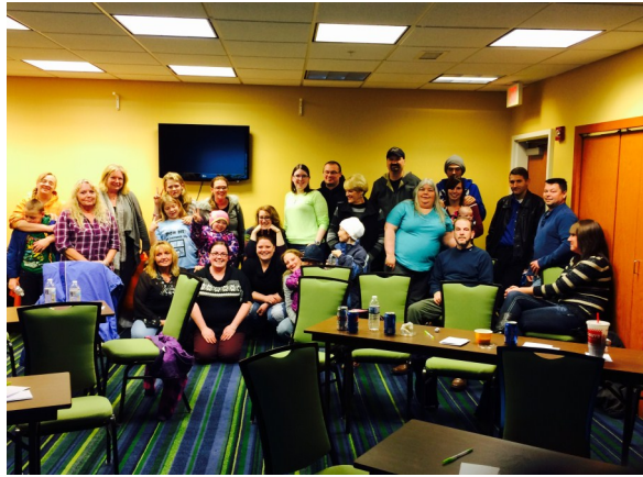
Fairfield Inn Brunswick associates enjoying trivia night and frozen yogurt