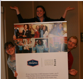
Bath Hampton Inn wins their third straight Light House Award!