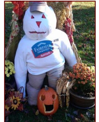
The Exeter Fairfield staff created a Scarecrow that was on display on Saturday, October 15, in Swasey Park for the "Exeter Fall Festival!"