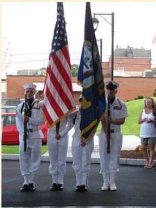
US Naval Cadet Color Guard of Bath, ME

associates that worked with us to get the New Hampton Inn Bath open & looking amazing, we are so happy to be part of MCHG family! Thanks to the corp. office team for sharing their space & for their continued support of Bath Hampton Inn Team!"